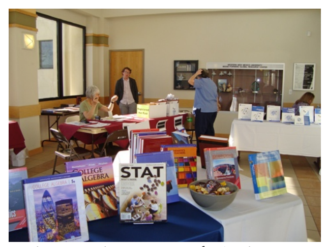
Vendor area and registration at the April 2009 section meeting.

Our newly renovated building will open in January with a state-of-the-art math learning center and four Smart classrooms. Recently hired under our