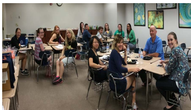
Society for Women in Mathematics Meeting