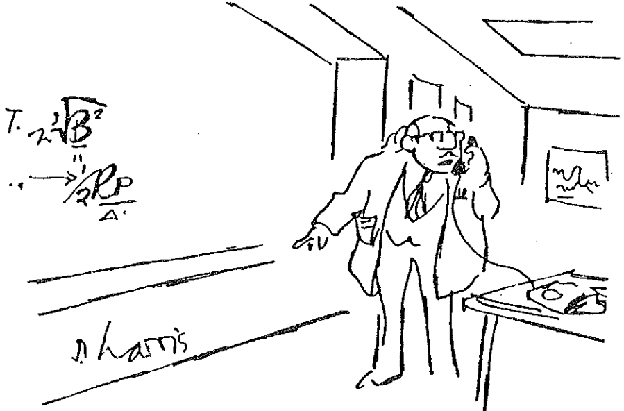
"I won? I didn't even know there was a Nobel booby prize."