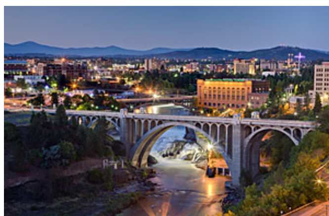
Spokane, Washington