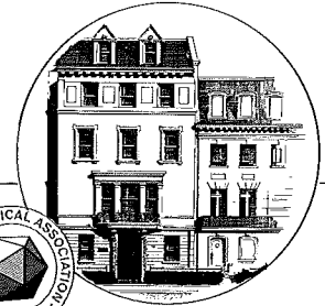
Edgar H. Vaughn Building Dolciani Mathematical Center