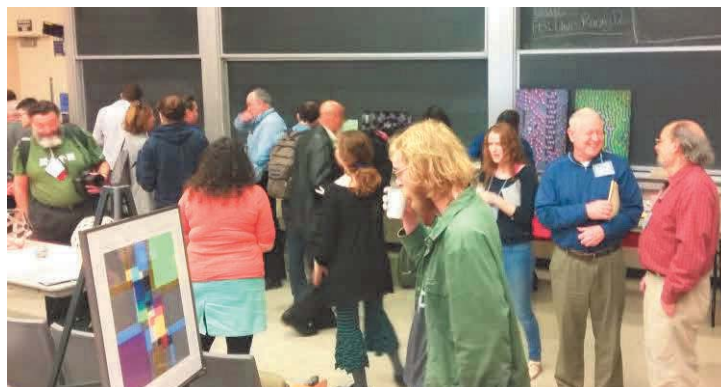
Mathematical Art Exhibition at the UC Davis Meeting, February 2016