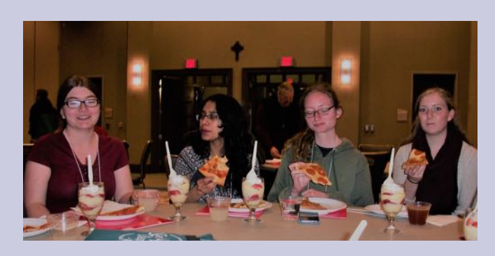
Students enjoying the pizza party.