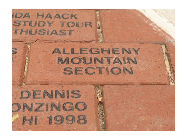
The Section's commemorative brick at the new MAA Carriage House meeting facility—If you're visiting MAA Headquarters during the Joint Meetings, see if you can find it!